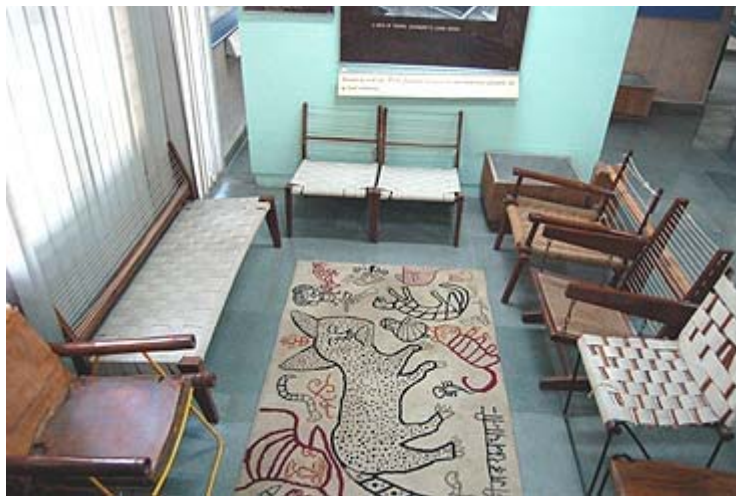
Corbusier furniture on display at the City Museum, Chandigarh

EXCLUSIVE: CHANDIGARH: LE CORBUSIER'S LEGACY