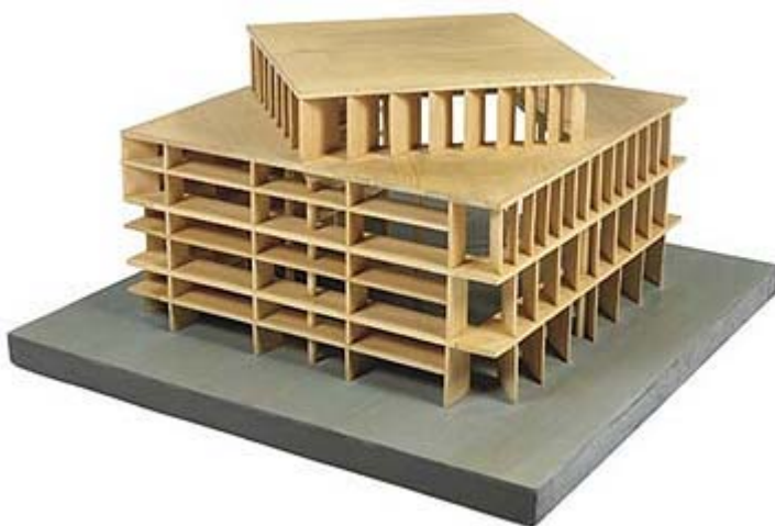
Tower of Shadows model. Sold for $33,600

But oblivious to its worth, this rich heritage today lies carelessly strewn around in various offices, gathers dust in government storerooms, or is sold off at auctions. A lot has been replaced by newer, fancier furniture. "No one wants this plain furniture any more," says Balwinder Saini, a senior architect in the UT administration whose office is one of the few which still retains some of the original furniture. It was only when a pair of stools fetched ,23,400 at a Paris sale that Chandigarh woke up in absolute disbelief. "For sometime now I've seen those wood and cane benches being used by security guards outside some judge's houses," says an architect. "No one even gives them a second look."