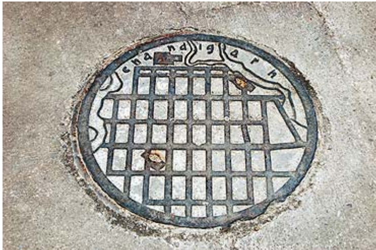
Manhole cover. Sold for $21,600 at Christie's

If the French, Swiss-born Corbusier made Chandigarh, the city in turn came to be recognised as his most famous work and put him right up there among the world's greatest architects. It's a living, breathing, inhabited legacy, one that's evident not just in the stunning capitol complex of the city's buildings, its wide boulevards and modernist mansions, but also in the umpteen fixtures designed for these buildings and public places such as the concrete lights at Sukhna lake, the models for bas reliefs in many buildings or even the blueprints of architectural plans. It lies as much in the furniture—office chairs, tables and stools—that Pierre Jeanneret designed specifically to fit in with the architect's vision for the city. Simple, functional and low cost, most of these designs were mass-produced by different local furniture makers.