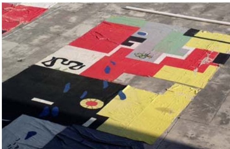
The moth-eaten tapestries from the assembly building lying in a storeroom

Nothing illustrates the carelessness of those responsible for protecting Chandigarh's heritage better than the saga of the three tapestries designed by Corbusier himself for the assembly building in 1960. In 1994, a 30 ft by 70 ft tapestry at the entrance hall of the Punjab Vidhan Sabha went missing. No one knows where the original is, and a replacement has now been put up there.